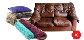
NO Clothing, Furniture & Carpet