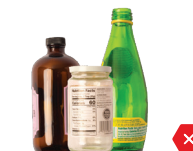
NO Glass Bottles & Containers