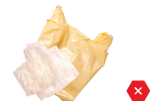
NO Loose Plastic Bags, Bagged Recyclables or Film Empty recyclables directly into your bin.