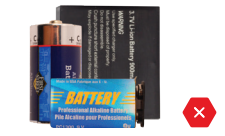
NO Batteries Check local drop-off programs for proper disposal